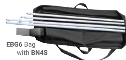
EBG6 Bag with BN4S

EBGC 22" x 4" x 3" bag for Cascade Lights only.