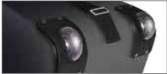
Wheels have protective outer enclosures.