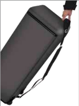
Pull handle and side strap.