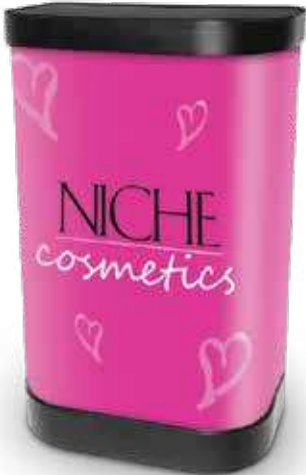
OPC1 & GFW1