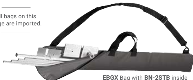
EBGX Bag with BN-2STB inside