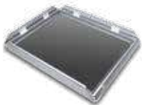
Laser Cut Bases

Front load, includes matte lens & styrene back.