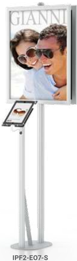
Drop-In Perflex Frames