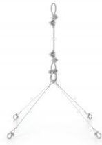
Optional Harness Set

HDC-6 - Because these structures are lightweight, we recommend using Double C Hooks and anchors to attach to ceiling.