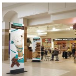
GREAT FOR HIGH TRAFFIC AREAS