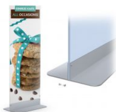
STURDY STEEL, 2 PIECE CONSTRUCTION