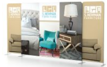
PW3103 - CENTER WALL WITH SIDE PANELS CAN BE USED STRAIGHT OR ANGLED