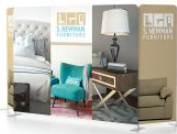
PW3103 - CENTER WALL WITH SIDE PANELS CAN BE USED STRAIGHT OR ANGLED