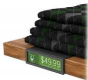
Simple and Elegant! Great for food service, hospitality, product identification, prices, retail signage and more.