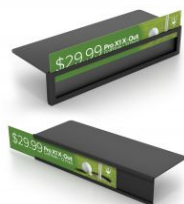
Top Loading or Side Loading