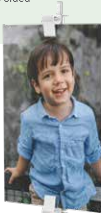
VCMCT1-S One sided clamp stand

Specify: Color* -S Satin Silver or -B Matte Black