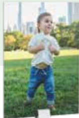
VCMTE-S 15" - 24" Telescopic clamp stand