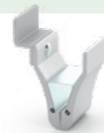
VCMWSW Mini Clamp with slot wall bracket.