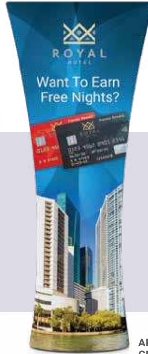
APF1 with GFX-APF