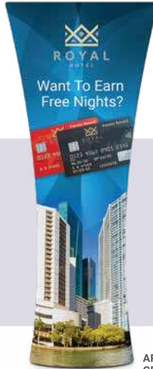
APF1 with GFX-APF