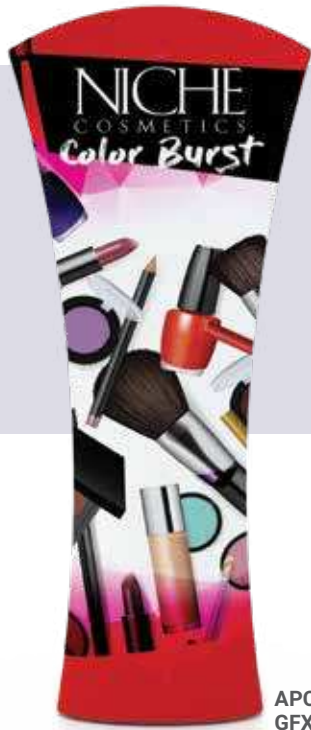
APC1 with GFX-APC