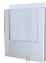
PB2C - LITERATURE HOLDER