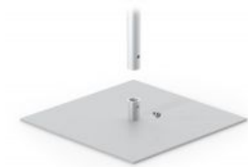
BN2SQ-S - TUBE ATTACHED TO PEENED ALUMINUM BUSHING