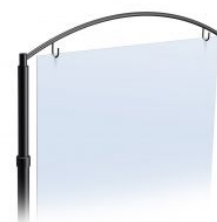
RADIUSED 25" LONG STEEL ROD. 2 WELDED J HOOKS SET ON 18" CENTERS