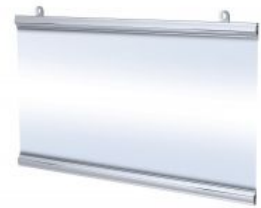
GC22-C SNAPGRAPHIC GRIPPER BAR ACCESSORY