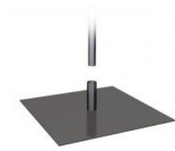
DOUBLE UNIT CENTERED BASE