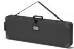
INSIDE DIMENSIONS ARE 3" X 12" X 36"