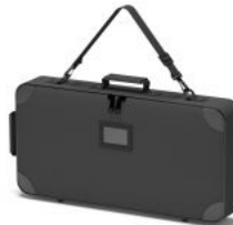
INSIDE DIMENSIONS ARE 3" X 12" X 24"