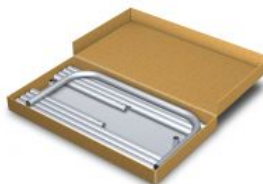
EFFICIENT PACKAGING, ECONOMICAL SHIPPING