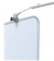
LED W/CLAMP FOR GRAPHIC STANDS