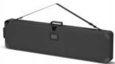
INSIDE DIMENSIONS ARE 3" X 12" X 48"