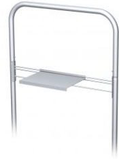
OPTIONAL ACCESSORY BAR (HMNB1) WITH SHELF (SHELF NOT INCLUDED)