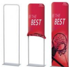
GRAPHIC CHANGES IN LESS THAN 1 MINUTE