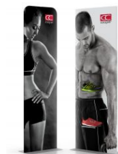
HMN4 (ROUND TOP) (LEFT) AND HMQ5 (SQUARE TOP) SHOWN WITH TWO SHELVES AND TWO ACCESSORY BAR ASSEMBLIES (SHOWN RIGHT)