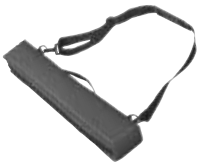
Accessory Bag fits all Cascade Lights EBGC 22" x 4" x 3"