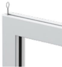
Metal eyes (ceiling)