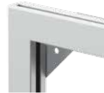
Corner brackets (wall)