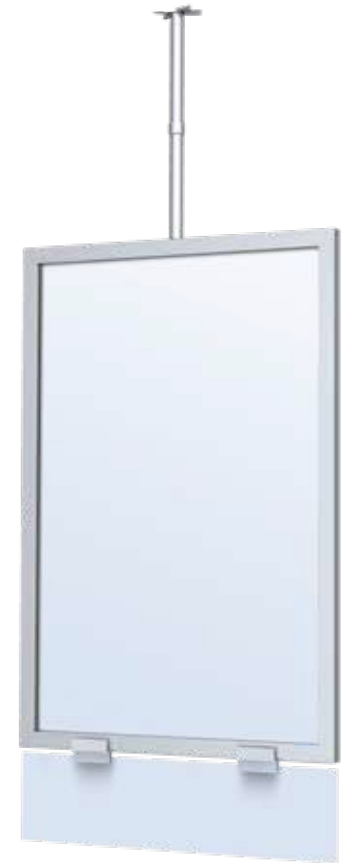
Custom grid ceiling hanging option with HD1 clip set.