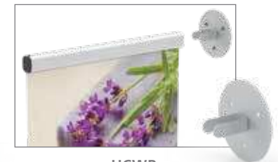
UCWB Wall Mount Bracket - set of 2, 3-1/4" diameter. For 36" maximum. Indicate -B Black or -S Silver