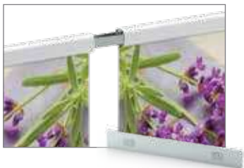
UC180 Steel Brackets Set of 4. Allows casings to be joined in series.