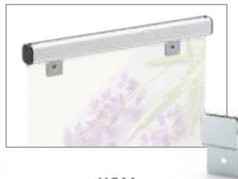
UC44 Wall Mount Kit for SN1 & SN2 Set of 4.