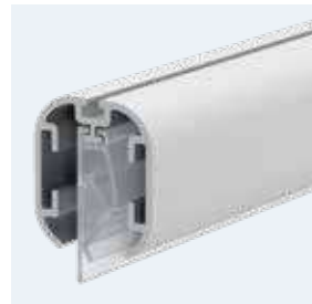
SN1 SnapGraphics .070" capacity.