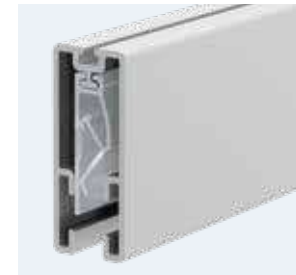
SN5 SnapGraphics .050" capacity.