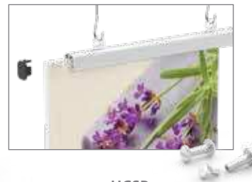
UCSP Aluminum Screw Posts, set of 2. Slide graphic 3/8" max. thick into casing.