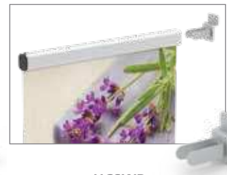
UCSWB Slatwall bracket - set of 2 for 36" max. Perpendicular to wall.