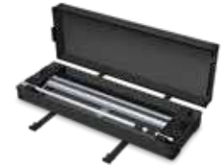
RY1-S-HC Banner Stand with Hardcase Kit.

Units 36" wide and less can be ordered with Hard Cases, simply add -HC after part #. For example: RY1-S-HC