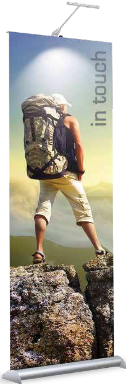
RY1-S with LEDBR1 light.