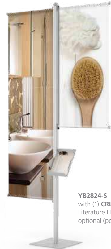
YB2824-S with (1) CRLSRM Literature Holder optional (pg. 33).