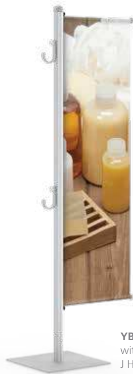
YB1618-S with (2) CRJH J Hooks optional.