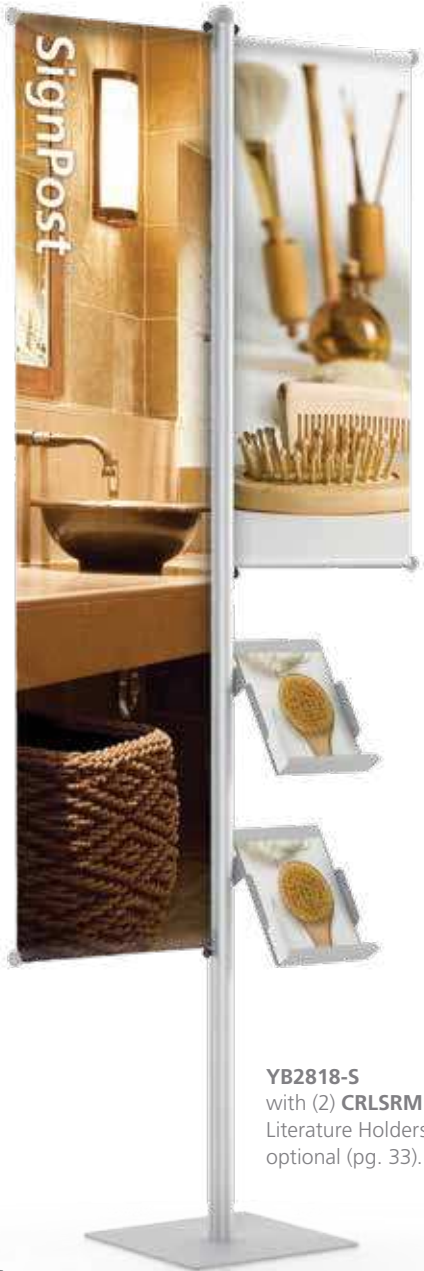
YB2818-S with (2) CRLSRM Literature Holders optional (pg. 33).