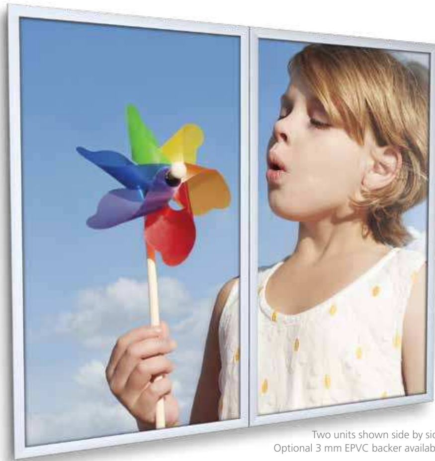
Two units shown side by side. Optional 3 mm EPVC backer available.